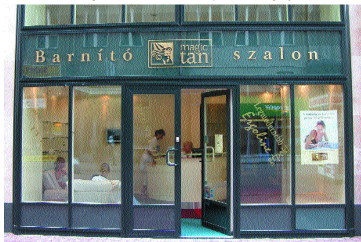
MagicTan Salon, Budapest, Hungary

* Note during the high volume period (average 25 sessions per day) your business may generate enough revenue to completely payback the equipment in all revenue cases.